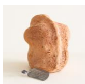
A commemorative pottery figure.

Our final day came all too soon and saw us packed up and on the road at 8.00am. Our first stop was at a 'Coming World Remember Me Workshop'. This workshop is part of a commemoration art programme, similar to the Tower of London Poppies project. Each pupil created a